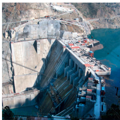
Baglihar Hydropower Project, India