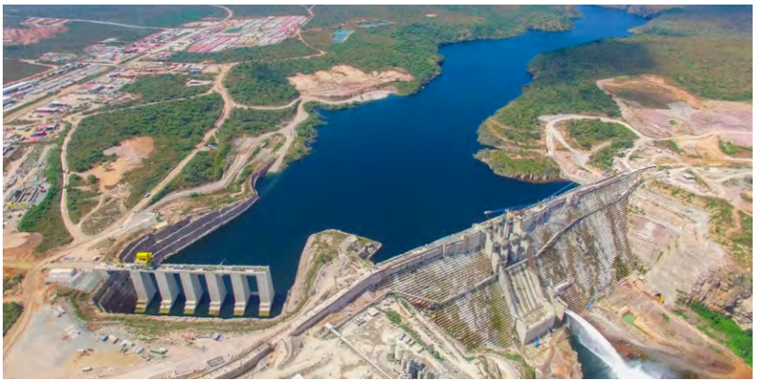
Laúca Hydropower Project, Angola: dam and power intake