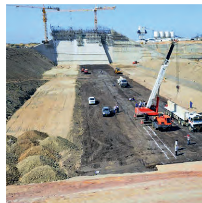
Dam Complex of Upper Atbara, Sudan: foundation of the embankment dam