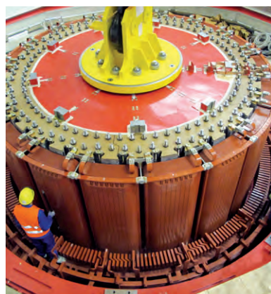
Vianden Pumped-Storage Plant, Luxembourg: generator rotor