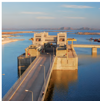
Toshka Pumping Station, Egypt