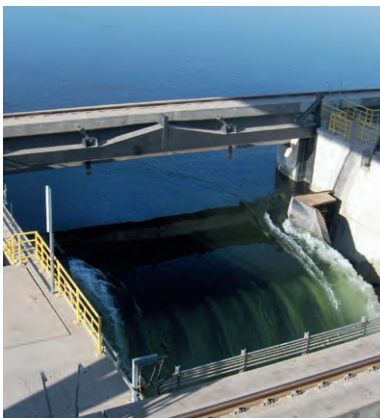
Naga Hammadi Barrage, Egypt: radial gate flap open

We prepare tender designs and construction designs for all types of hydraulic structures including structural engineering. These include river diversion schemes, gated and ungated spillways for reservoirs, powerhouses, any type of outlet works, as well as navigation locks and ship lifts for navigable waterways.