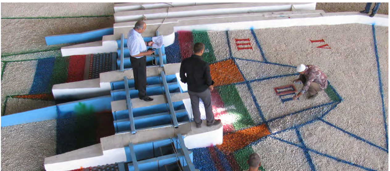
Physical model tests of scouring protection measures

Studies on the deposition of the dredged sediments were carried out. Subject of the studies was to investigate the possible treatment of the pumped sediment-water mixture, also referred to as slush, either onshore in the form of tailings, or returning it to a river under compliance with strict environmental legislation.