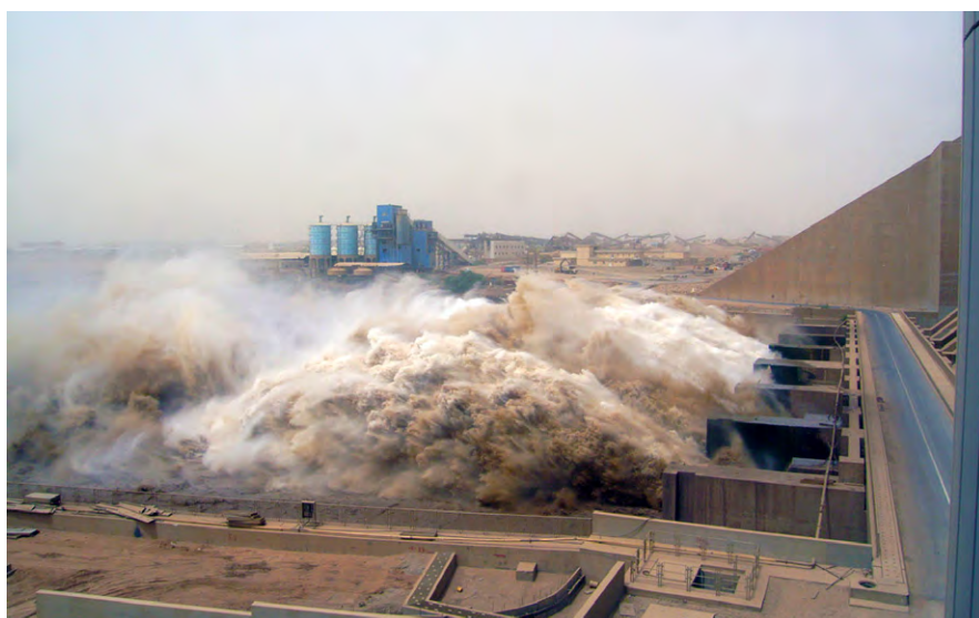
Flushing operation during flood season to prevent depositions in the reservoir

Flushing and sluicing help reduce or even avoid the settling of particles and can even remobilize settled sediments. Both commercial and in-house developed numerical tools also allow the quick and efficient testing of flushing and sluicing scenarios. Another subject of a reservoir sedimentation study can also be the development of operation rules comprising the most economic balance between maintaining power production as high as possible during the flood, and the sustainable minimization of the settling of sediments.