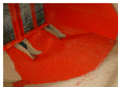
Sediment sluices under a power intake after a successful test (before and after flushing operation – 1:35 scale model).

Cover: Sediment delta at Phewa Tal Reservoir, Pokhara, Nepal. Impounded in the late sixties, the foreset has progressed to the main body of the reservoir.