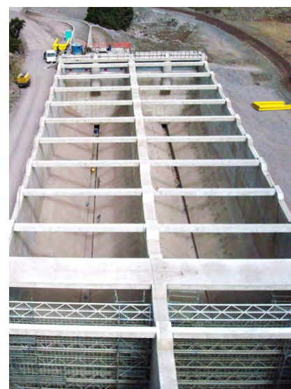
Desander with an integrated flushing device. Project: La Higuera HPP in the Chilean Andes.