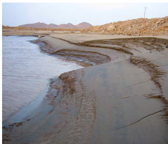
Overwhelming depositions of fine sediments after only one flood season