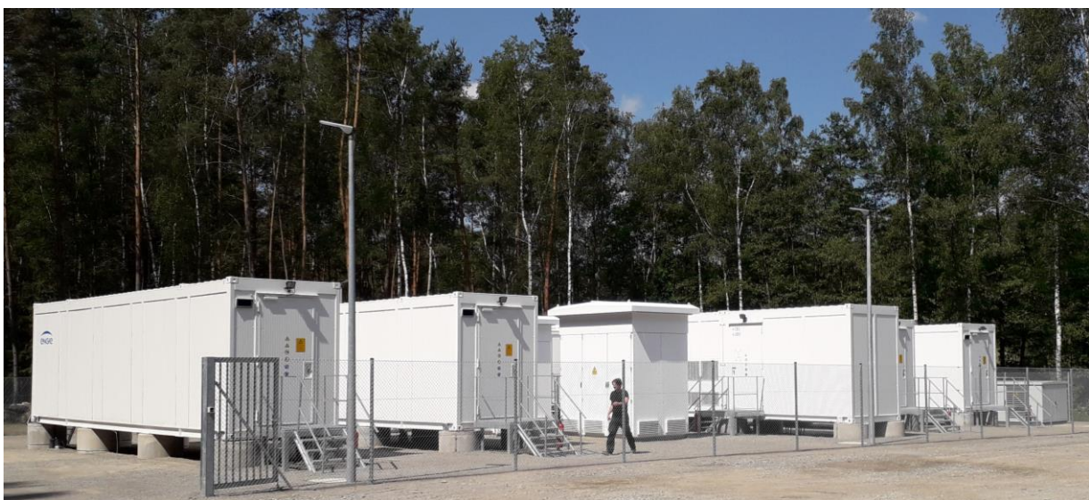
Fig. 2. ENGIE’s recently inaugurated 13.5 MWh battery energy storage system

An innovative 13.5 MWh battery storage system was implemented by ENGIE Deutschland on the site of the Pfreimd hydro power plant group in the Upper Palatinate, Germany (Fig. 2). The existing 137 MW hydro scheme provides 5% of Germany’s grid balancing energy and thus contributes to a secure energy supply. It provides grid and ancillary services comprising FCR (“primary control”) of 3 times \pm 16 MW, automatically activated Frequency Restoration Reserve (FRR-a, “secondary control”) of -75 MW to +90 MW and manually activated Frequency Restoration Reserve (FRR-m, “minute reserve”) of -99 MW to +114 MW [11]. The scheme provides black start capability.